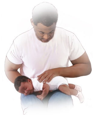
Place the baby on his belly across your lap