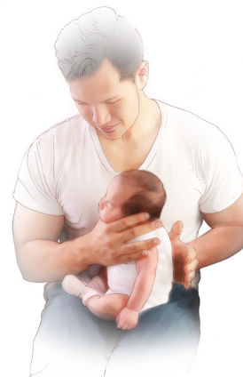
Hold the baby in a sitting position